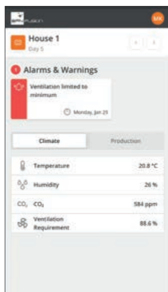
Alarms in the BFN Fusion app