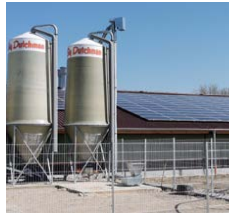
System power: 99 kWp