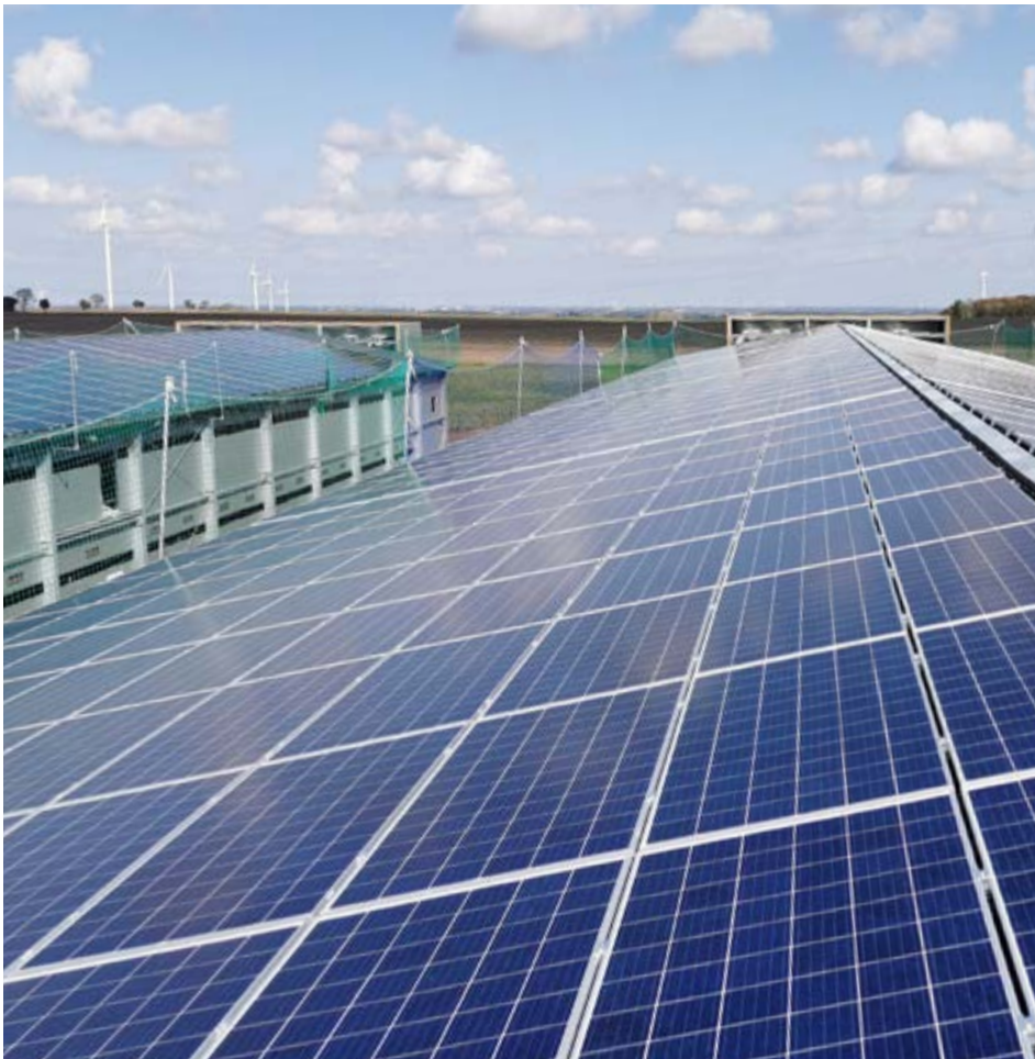
System power: 749 kWp