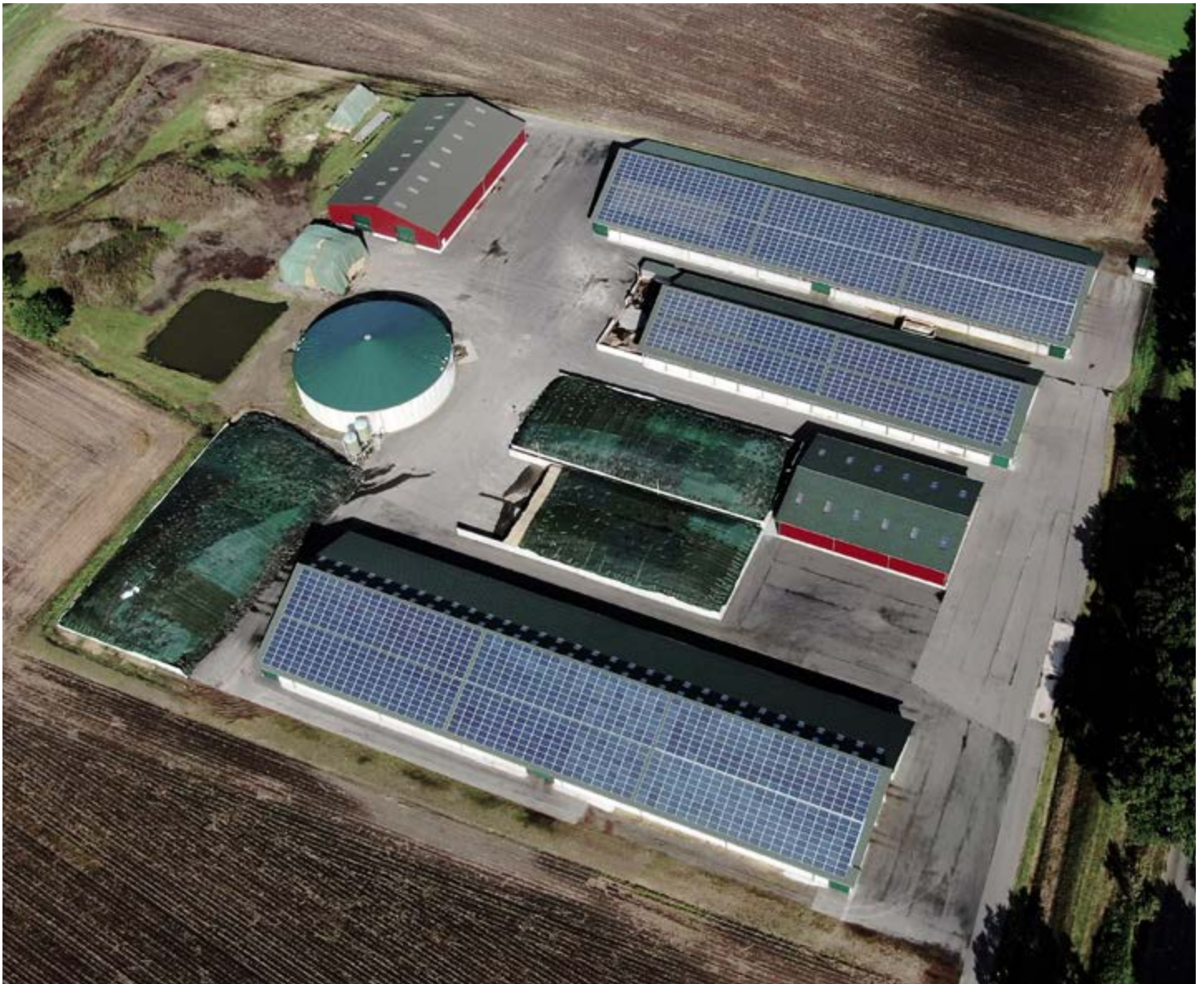
SUNFarm with a power of 669.76 kWp and 2392 modules