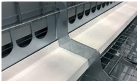
View of the feeding windows in the start tier and of the plastic footrail