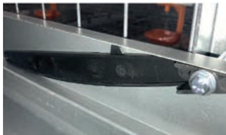
No more feed losses due to the new height adjustment for the feeding windows in the start tier