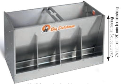
MultiMax made of stainless steel