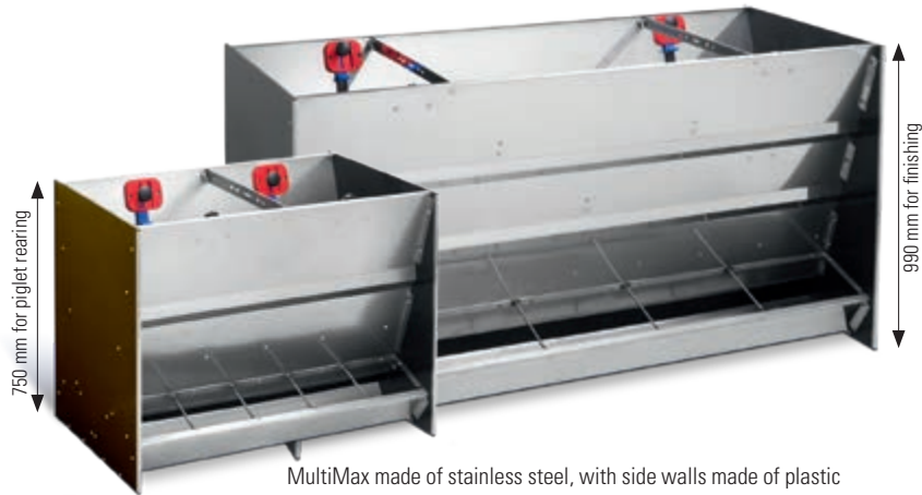
MultiMax made of stainless steel, with side walls made of plastic