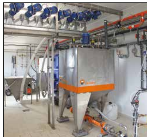
HydroAir – precise piglet liquid feeding

If the piglets are to be supplied with liquid feed, we recommend installing the HydroAir feeding system with sensor trough which allows producing small feed quantities which can then be supplied freshly prepared as required.