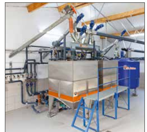
HydroMix – computer-controlled liquid feeding

The Big Dutchman HydroMix liquid feeding system is the right system especially for producers who want to reduce feed costs by feeding inexpensive by-products.