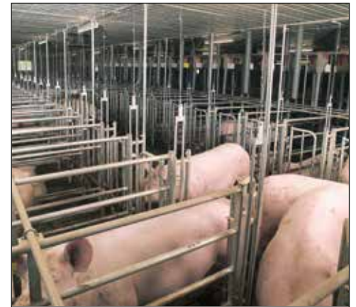
Free-access stall "Easy Lock"

In the gestation area, group housing of sows is becoming more and more important. Free-access stalls permit the sows to enter and leave the stall on their own.