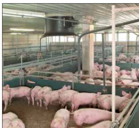
Liquid feeding with HydroMix and BigFarmNet

The ideal fully automated liquid feeding system for growing pigs is HydroMix. This reliable feeding system automatically prepares feed from individual components fully adapted to the needs of the growing pigs. Two of the main advantages of the HydroMix feeding system are the exact dosing precision at every feed valve and the overall flexibility of the system which allows us to find the perfect solution for every customer.