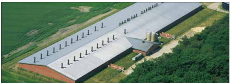
Farm Garther Heide in Germany with 2000 sow places

F eel free to contact us any time for additional information or a detailed consultation.