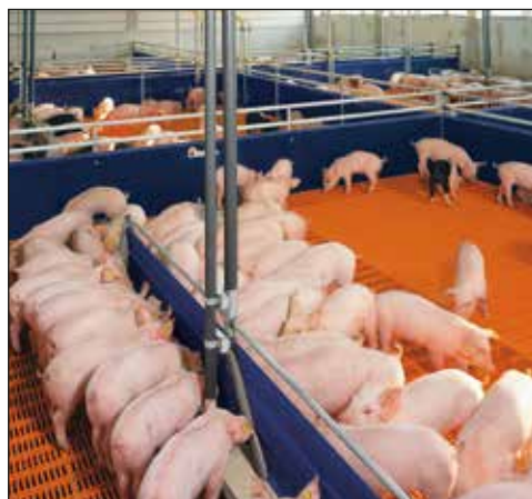
Liquid feeding for piglet rearing

The right feeding technology is essential for every producer. Big Dutchman's DryRapid is an efficient tube feeding system which is ideally suited for sows, growing and fattening pigs. In combination with the PigNic and PigNic-Jumbo automatic feeders it is possible to achieve high daily weight gains.