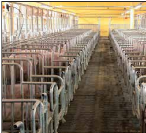
Service centre with separate boar pen

Our extensive product range also includes the specific ventilation, heating, cooling and exhaust air treatment systems for optimal climatic conditions in every pig house.