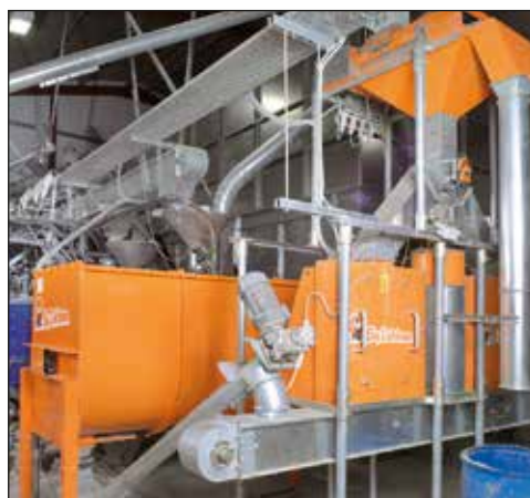
Feed kitchen with feed mill, mixer and HydroMix

BigFarmNet is Big Dutchman's completely new developed control and management system for any type of pig production. The new software is very user-friendly and shows the same user interface for every application, be it production, environment control or data evaluation. This means that you are finally able to control your liquid feeding system, the house climate and all of the administrative tasks with a single computer and software!