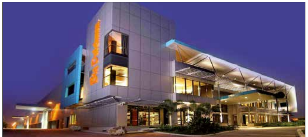
Big Dutchman Asia – company headquarters in Kuala Lumpur, Malaysia

Worldwide, Big Dutchman is a symbol for quality, reliability and efficiency. Innovative technology, consistent development of products in line with market requirements, and the realization of individual solutions for our customers are part of a successful company strategy. Subsidiaries and representative offices in many countries ensure market proximity and also serve as well-functioning and reliable service network.