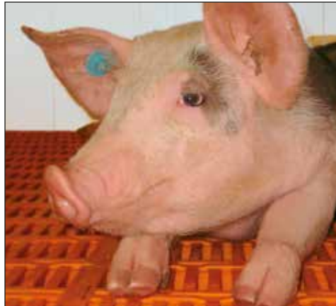
Modern housing and feeding equipment

Successful sow management requires expertise and, of course, the corresponding technical conditions. Big Dutchman sells state-of-the-art housing and feeding equipment and can thus provide a solid basis for economic success.