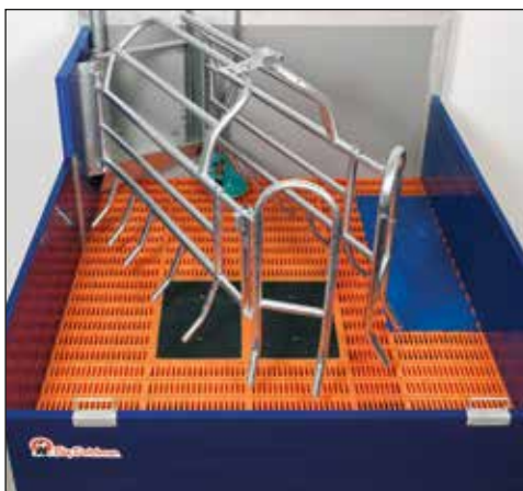
Farrowing pen with animal-friendly flooring

The local station computer can be installed in the aisle. This makes for better accessibility (animal-free zone) and enables the service personnel to make adjustments without being disturbed.