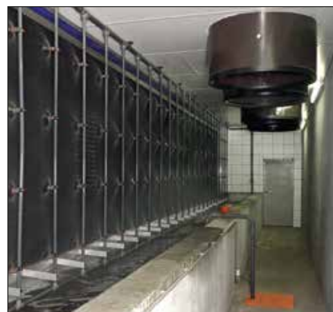
MagixX-P – the efficient exhaust air washer

Big Dutchman's extensive product range also comprises milling and mixing installations. The trend is increasingly going towards using home-grown cereals for production of mixed feed as it allows the production of individual recipes of known quality and also reduces transport costs. The reduction of emissions of livestock production facilities is becoming more and more important. With MagixX-P, Big Dutchman can offer its customers a highly efficient exhaust air washer.