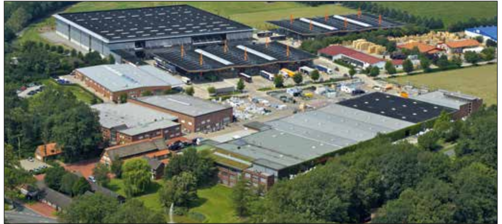
Big Dutchman International GmbH – company headquarters in Vechta, Germany

The company headquarters are located in Vechta, Germany for Eastern and Western Europe and the Middle East. The Asian region is overseen from the central office in Kuala Lumpur, Malaysia and the main representation for North and South America is located in Holland, Michigan, USA.