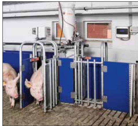
CallMatic pro – electronic sow feeding

Individual feeding means that feed is distributed as required by the condition of the individual sow. Feed can be supplied either dry or liquid.