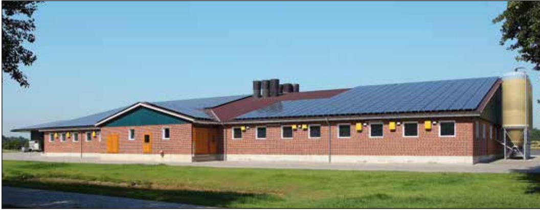
Finishing farm with 1800 places

F rom the feed mill to the ready-to-slaughter finishing pig – Big Dutchman supplies housing equipment of all kinds to customers around the world. Many years of experience and sound technical know-how ensure that our equipment works reliably in all climates and under all conditions.