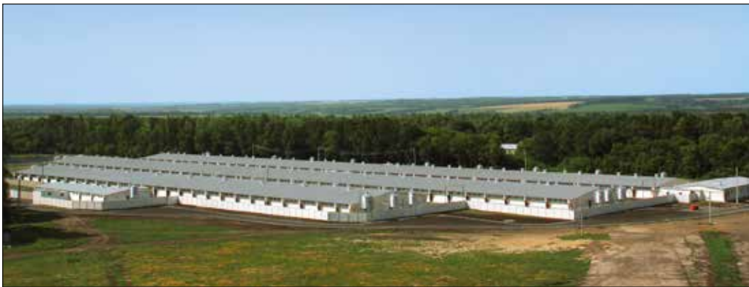
Farmkomplex Rakitianskij in Belgorod, Russia, with 4800 sow places

T ime and again the future presents new challenges which we want to meet together with and for the benefit of our customers all around the world. With this in mind, we plan to strengthen and further extend our position as recognized market leader.