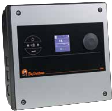
135pro – computer for climate control