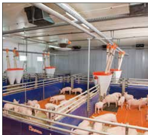
PigNic-Jumbo for piglet rearing

With state-of-the-art equipment, Big Dutchman is providing you with everything you need for modern and successful pig production. No matter whether it concerns a new building, remodeling, or refurbishment of an old building, our experts will find the optimal solution for your requirements.