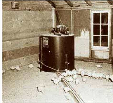
Automated chain feeder 1938

In 1938 two brothers invented the world's first automated poultry feeder in the USA. In honour of their Dutch origin they named their company Big Dutchman. This new feeder greatly increased the productivity of commercial egg and poultry meat production.