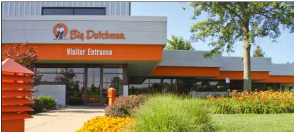
Big Dutchman, Inc. – company headquarters in Michigan, USA

Big Dutchman employs more than 2000 people around the world. Approximately 250 engineers and technicians are working on improving and further developing the existing Big Dutchman product range on all levels.