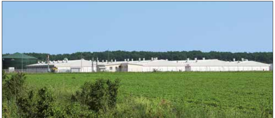
Farmkomplex Andrijaševci 1, Croatia, with 1500 sow places

N o matter if a farm is to be equipped in southwest China or in icy Siberia – Big Dutchman always offers the perfect solution to every possible problem. It makes no difference whether it concerns a project with 100, 1,000, 10,000 or 50,000 pigs: our reliable, state-of-the-art systems are always custom-planned to meet our customers' needs.